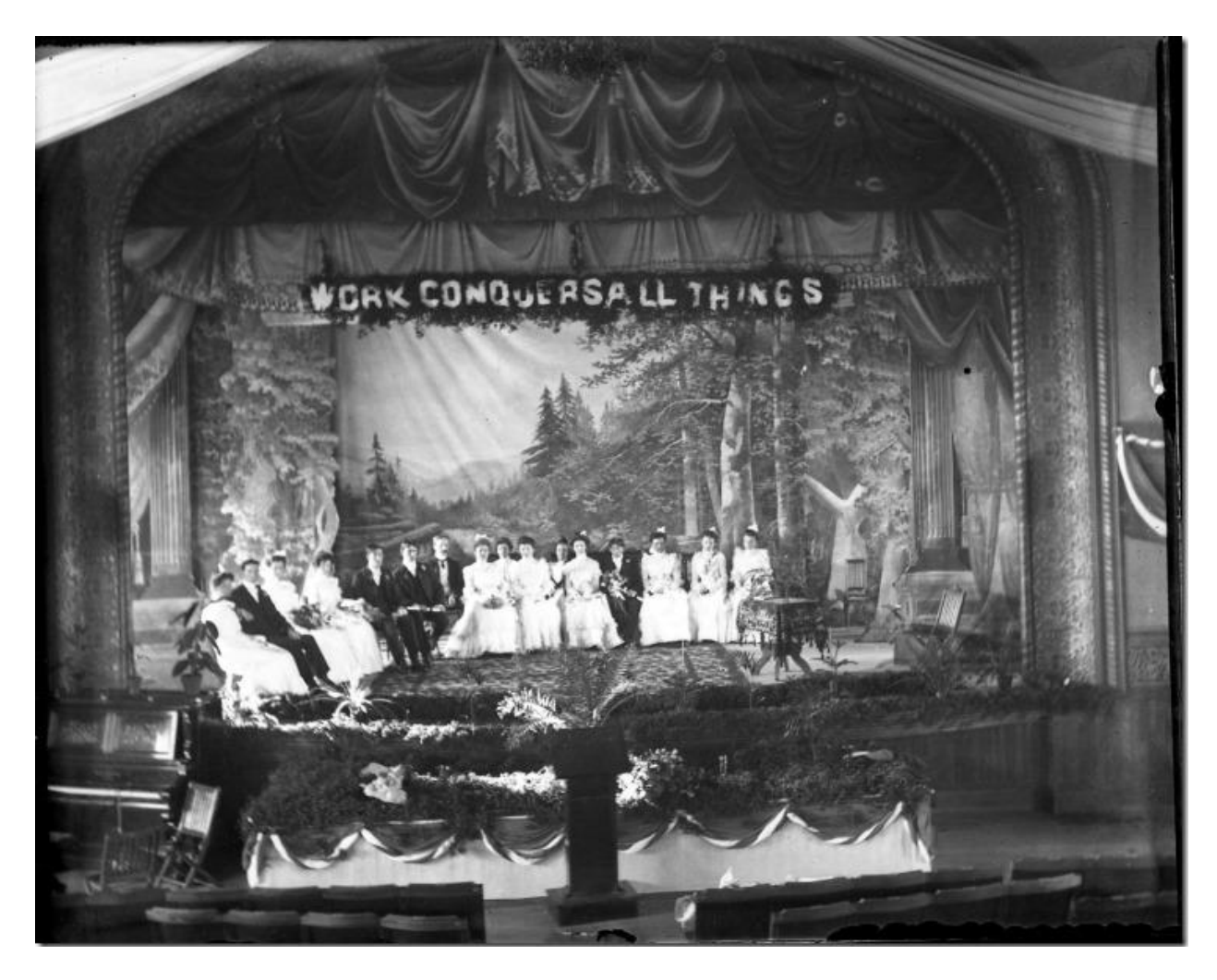
Most of the glass negatives appear to have been taken around the turn of the last century, dating to circa 1900. This image of the Franklin Opera House shows the incredible painted scenery, the black decorative valence that still hangs above the stage to the rear, and is that an orchestra pit in front of the lectern filled with greenery? If so, it is a rare photo indeed.