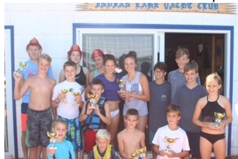
Boat Race Winners: (Better picture)