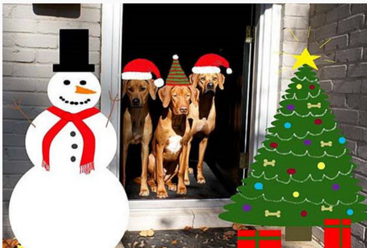
Three Ridgebacks on the lookout for the man in red

Respectfully submitted / Cheryl Fraser / NERRC Secretary