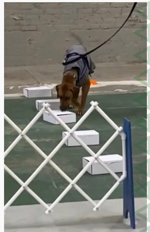
Working a container search.

For more detailed information please visit the NACSW web site at https://www.nacsw.net/