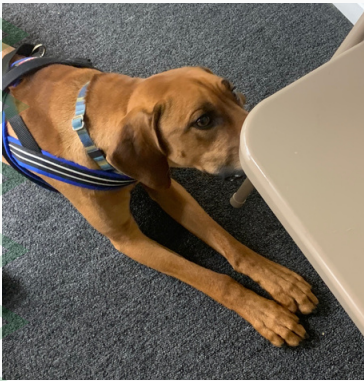
Indicating he found the scent

The United States Canine Scent Sports (USCSS) was founded in 2016 by performance dog trainers. The USCSS strives to create a fun search environment with more flexibility for trial hosts. Competitors are allowed to spectate after they have run and can run additional dogs For Exhibition Only (FEO). Dogs must be at least 6 months and handlers must be at least 10 years old. Any breed of dog may compete, reactive dogs, dogs with disabilities are allowed to compete. There is no odor test required. There is a free lifetime membership for the handler and a one-time registration fee for each dog. The odors used are Birch, Anise, and Clove. The classes offered are the classic elements: Interior, Exterior, Vehicle, Containers, and game classes: Detection Dog Extreme, Copy Cat, Double Dog Dare, Go the Distance, Heap O'Hides, LudicrousSpeed, Scenting Sweepstakes, Team Spirit. Possible titles include Novice A, Novice B, Intermediate, Advanced, Senior, Master.