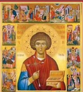
Gr. Martyr and Healer St. Panteleimon