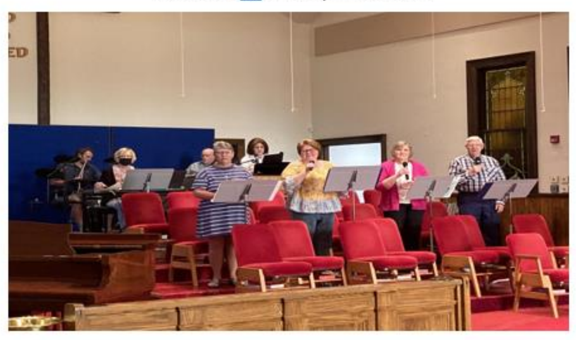
Conway Ringers and Chancel Choir