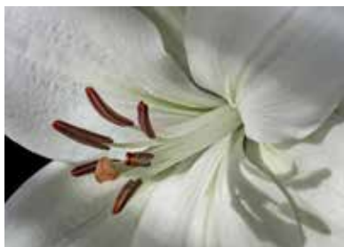
Morning Shadows Rose Epps