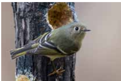
Orange Crowned Warbler