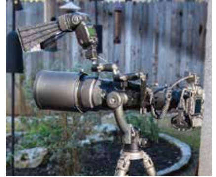
500 mm Lens & 1.4 Tele-extender

The photo equipment I use from the bottom up is a Gitso tripod with a Kirk ball head and a Wimberly Sidekick to support the camera and lens. The camera is a Nikon D 500, (able to shoot a burst at 10 frames per second), along with either a 500 mm f4 or an 80 -400 f 4-5.6 lens. I frequently also use a 1.4 teleconverter. I usually shoot at about f 5.6 with the ISO set to whatever value gives me a fast shutter speed, a minimum of 1/250 second or faster. These little birds are quick! Flash with an extender is also helpful not only for exposure but to create that little catch light in the birds eye. I usually set the flash to 1/28th or 1/64th power. At those settings it can flash rapidly several times before needing to recharge.