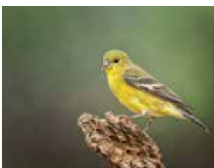
Lesser Goldfinch Paul Munch