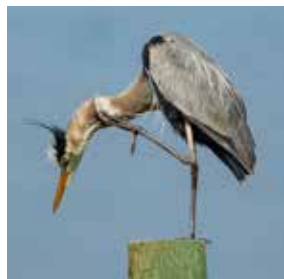
Great Blue Heron Dolph McCranie