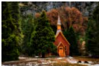
Yosemite Chapel Phil Charlton