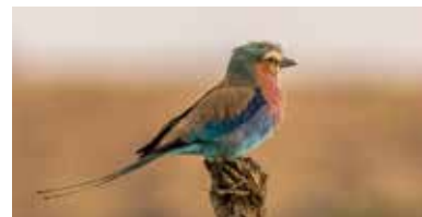
Lilac-Breasted Roller