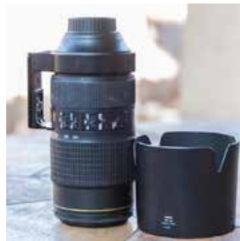
400 mm Lens