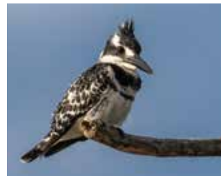
Pied Kingfisher