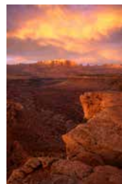
Canyon Country Sunset Larry Peruffo