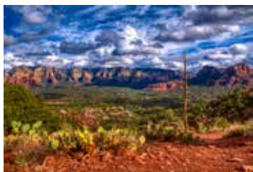
Sedona Mesa Beverly Lyle