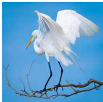
Posing White Egret, High Island Steve Houston