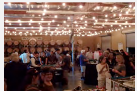
3 rd Annual Casino Night Fun!