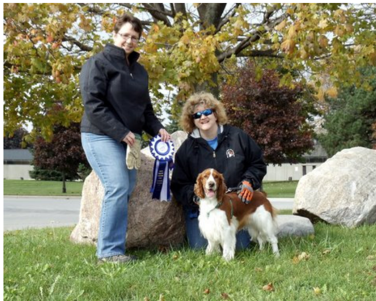
Judge Heather MacLeod