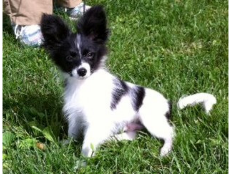
Bluechip Bow Ty at Luvits "Ty" is a Papillon Owned by Ricki Abrams