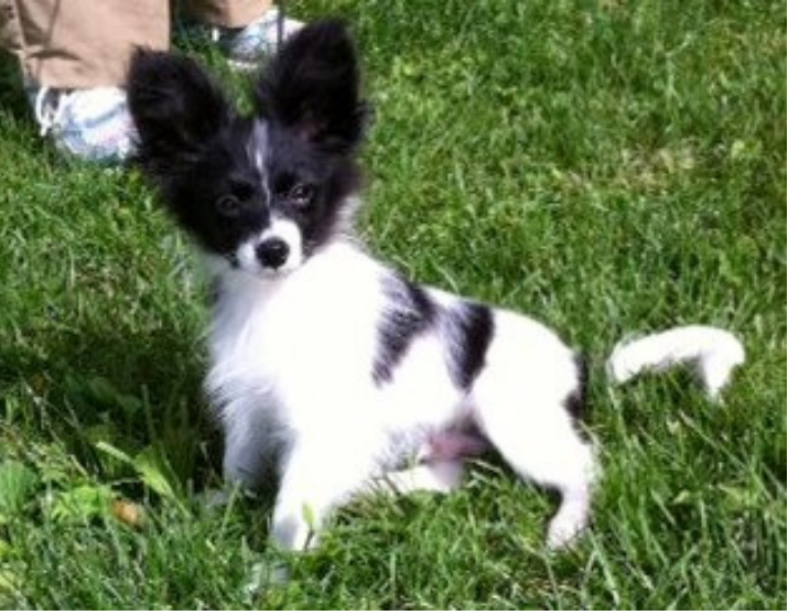
Bluechip Bow Ty at Luvits "Ty" is a Papillon Owned by Ricki Abrams