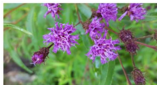
New York Ironweed