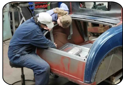
Measure and follow the plan