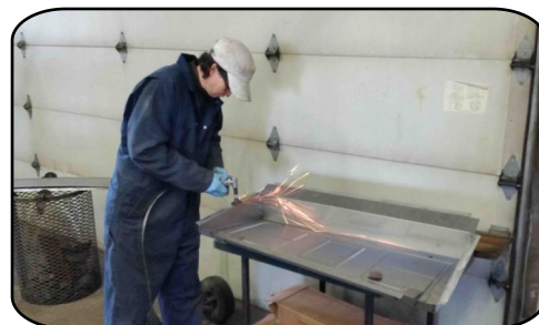
Getting it just right