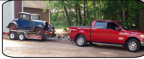
"Clifford" pulling "Daisy" home