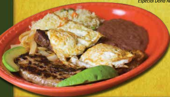
Especial Doña Reina

A typical salvadoran dish including steak, sausage, and an egg. Served with avocado, rice, and beans. Un típico plato Salvadoreño mixto de chorizo, carne, y un huevo. Servido con aguacate, arroz, y frijoles. $ 18.99