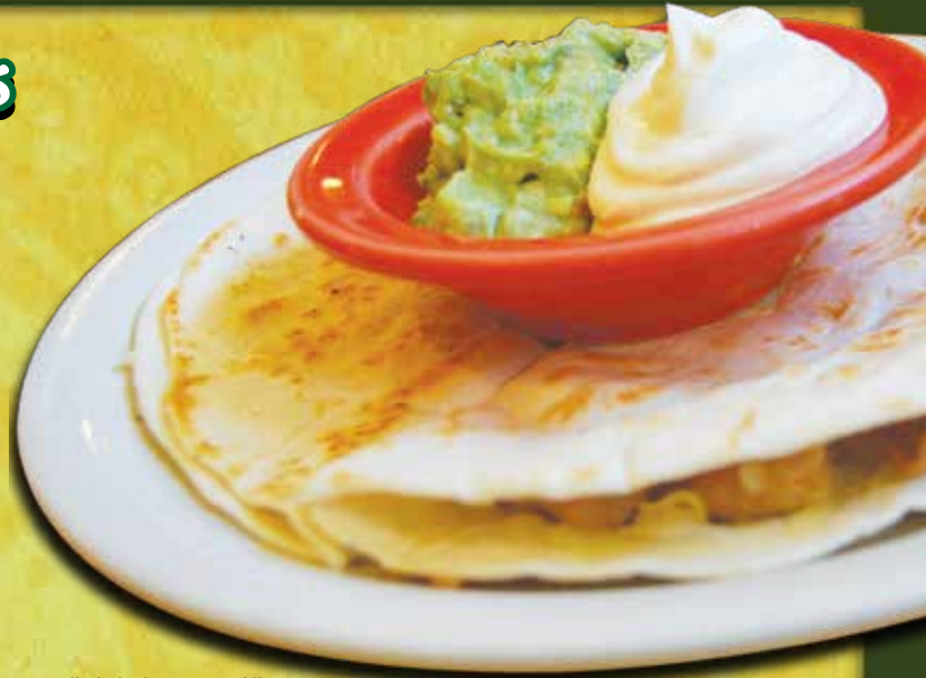
Grilled Chicken Quesadilla

A chicken broth based soup, with chicken wings, potatoes, green beans, zucchini, carrots, and rice. $ 11.99