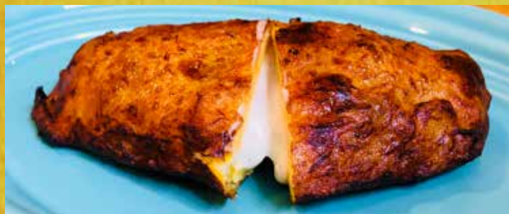
Empanadas de Platano

A seasoned fried corn flour tortilla topped with refried beans, pickled cabbage, grated cheese, sliced egg, and your choice of ground beef or shredded chicken. $ 2.99