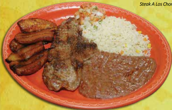
Steak A Los Chorros

Steak marinated in our special sauce and spices, served with fried plantains, pico de gallo, rice, and beans. $ 18.99