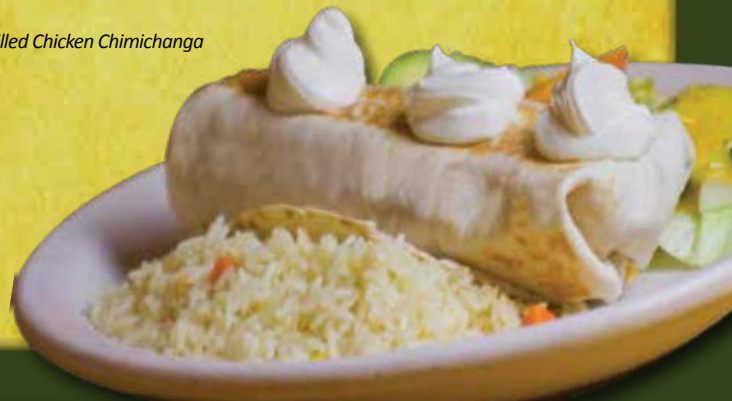
Grilled Chicken Chimichanga

Extra large flour tortilla filled with a generous portion of grilled chicken breast, beans, and cheese, rolled and grilled, topped with sour cream, and served with rice. $ 15.49