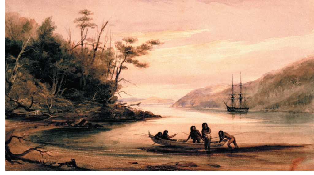
A distant HMS Beagle off Tierra del Fuego in South America in the 1830s, painted by Conrad Martens.