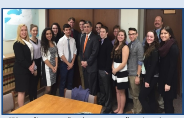
West Genesee Students got a first-hand experience in advocating for education funding during their recent trip to Albany.