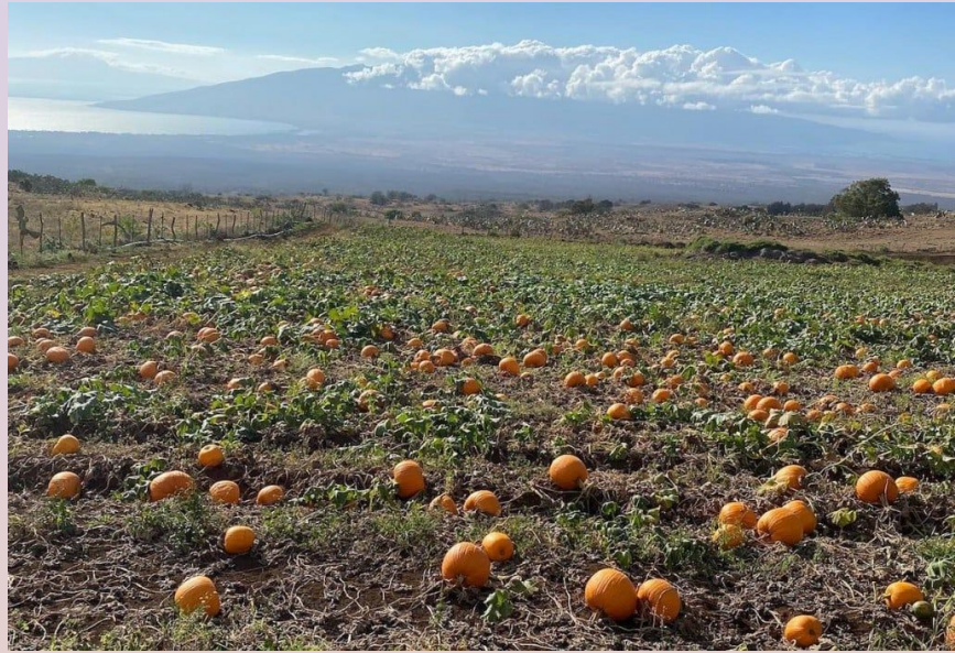
Kula Country Farms

Hoping you had a great spring, adventurous summer and now able to enjoy the warmth or heat of fall. Our spring workshop with Lorraine Freedle on King Tut was wonderful presentation that included the journey of a young boy's healing. Please see a summary about the workshop in this