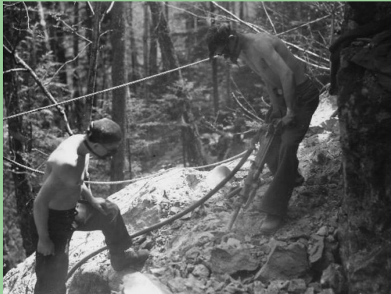
The stone staircase and trail down down to Glen Ellis Falls is one of the signature CCC projects. In this photo, they're jack hammering ledge.

(The text and photos below are drawn from the White Mountain trail building history exhibit to be permanently installed at Camp Dodge. A mock up of the exhibit will be ready for display at Centennial Reunion Aug 24.)