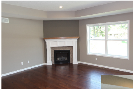
SOME OPTIONS MAY BE SHOWN