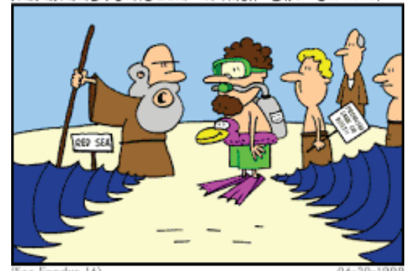
I THINK THAT YOU HAVE SOME SERIOUS FAITH ISSUES

The Development and Peace – 2019 Caritas Canada Solidarity Walk took place on Saturday, June 15th. Many migrants, refugees and immigrants