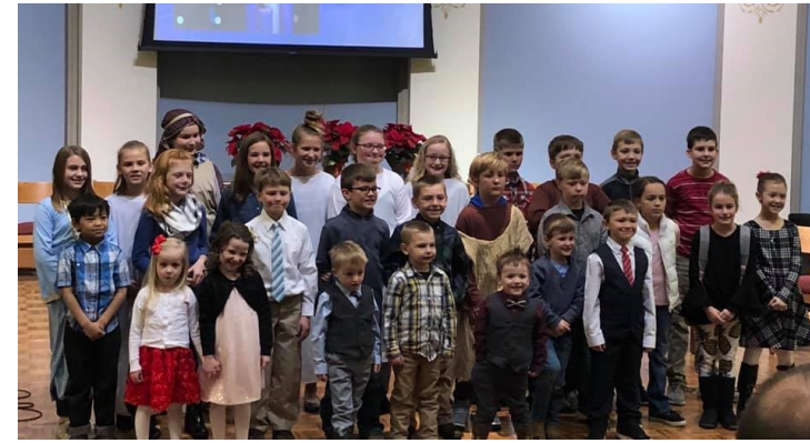
These children took part in the Christmas program entitled "The Christmas Story" that was presented in the St. Paul's sanctuary on Sunday, December 16th.