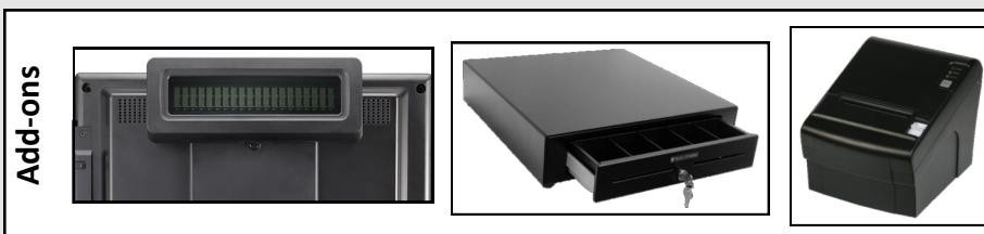
Customer Display (optional)