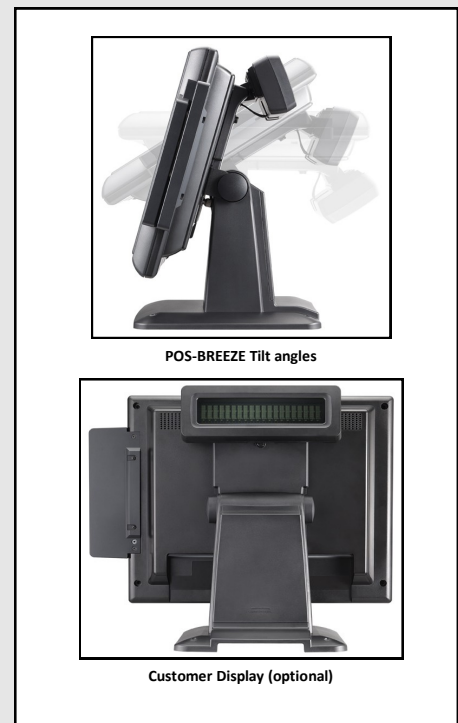
POS-BREEZE Tilt angles