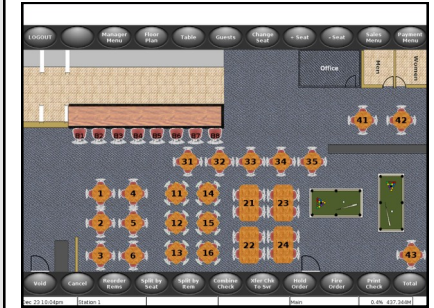
Floor Plan Screen