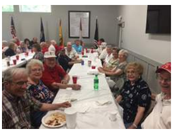
LOH members at the annual Flag Day picnic