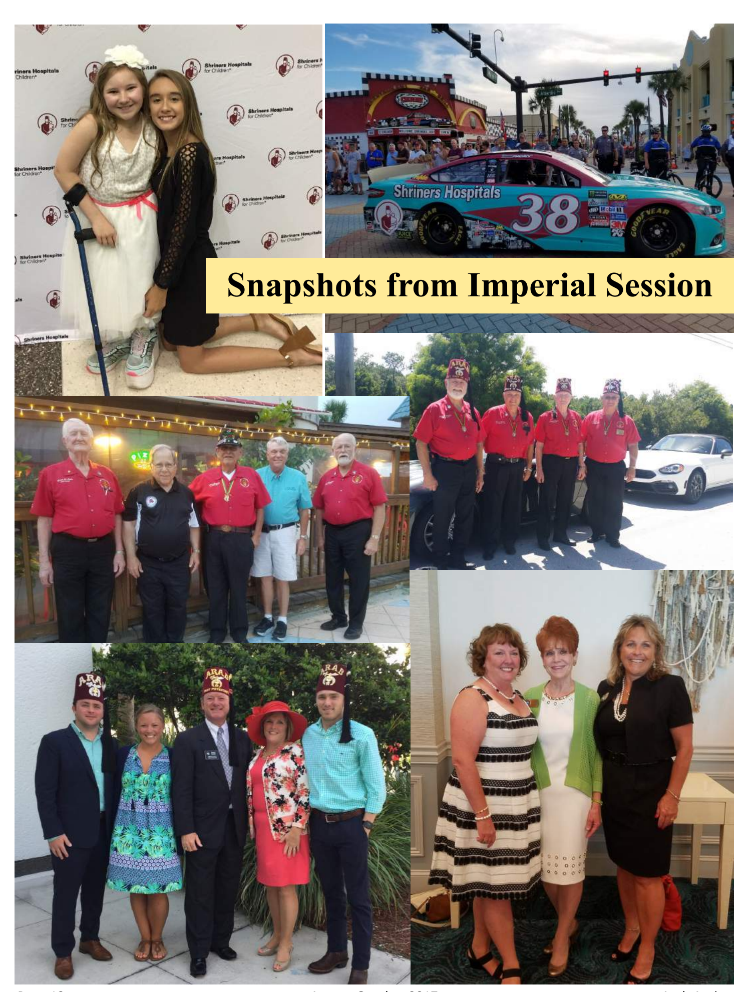
Page 13 August-October 2017 Arab Antics