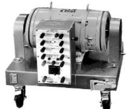
DM-300 DC Machine