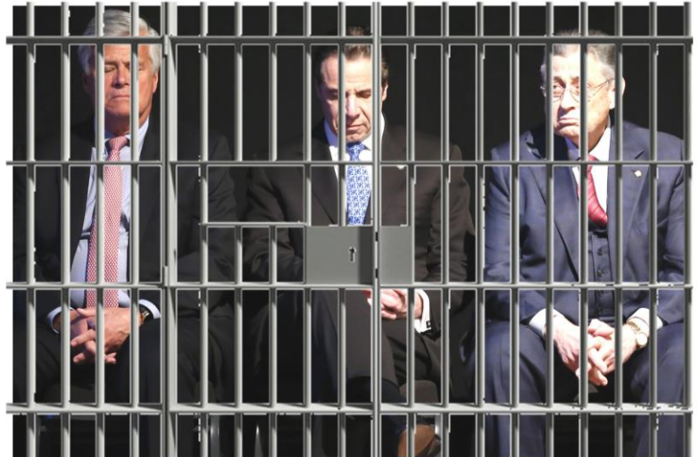
There were three in the cell and the little one yelled roll over, roll over