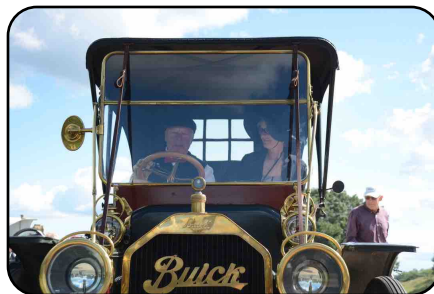
New London to New Brighton