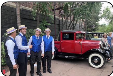
John Phillips Souza Concert