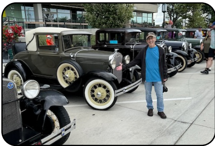
Oak Leaf A's in Detroit Woodward Cruise