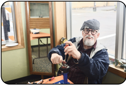
Tune Up Clinic

Goals for the new year: learn more, make more friends, help others to understand what this club and hobby is about. Help out as much as possible to make events and meetings successful to make this a good year.