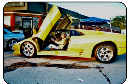
Detroit Woodward Cruise