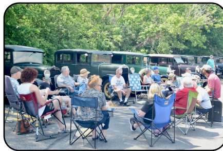
Running Board Lunch