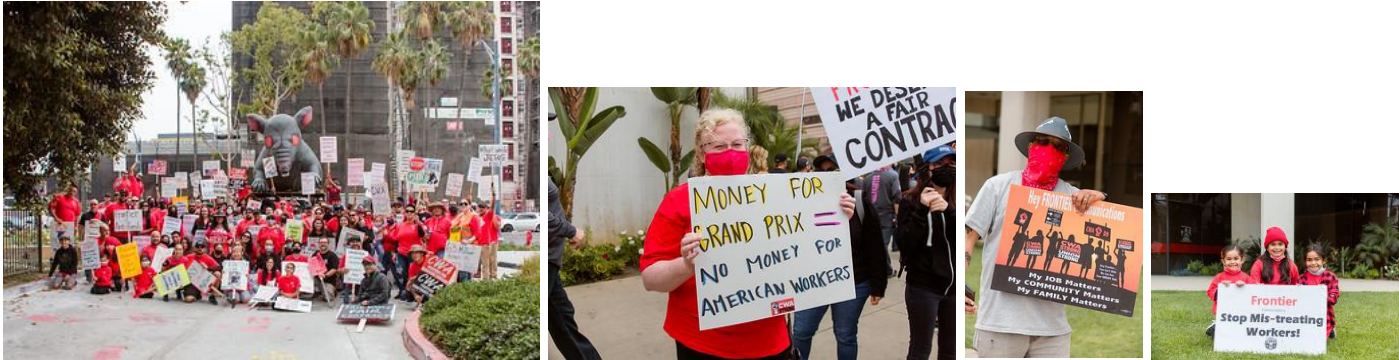
Long Beach Grand Prix Rally