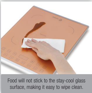
Food will not stick to the stay-cool glass surface, making it easy to wipe clean.