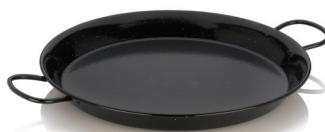
12.5" Paella Pan