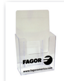
Acrylic Brochure Holder with Fagor Logo