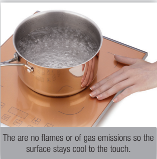
The are no flames or of gas emissions so the surface stays cool to the touch.