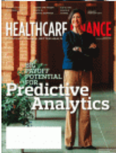
( http://www.healthcarefinancenews.com/issue/january-february-2015-0 )