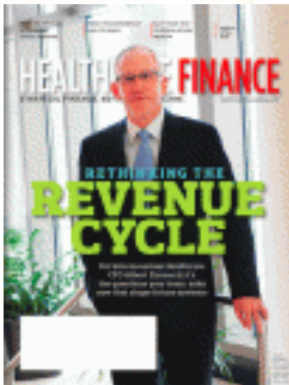
( http://www.healthcarefinancenews.com/issue/march-april-2015-0 )