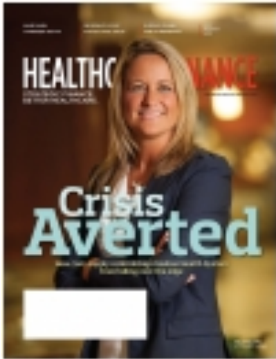
( http://www.healthcarefinancenews.com/issue/july-august-2015-1 )