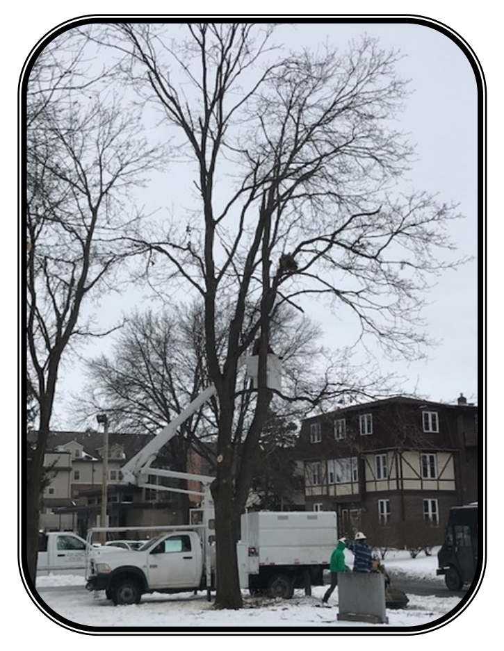
A tree service trimmed the two large oak trees in the front yard and removed a damaged maple near the street recently.

For more information on the book or to order a copy, <u>click here</u>. Or you can call or email the church office and we will order a copy for you for $10. Order deadline is February 27 .