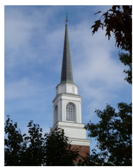
March 2022 Volume 68, No. 3