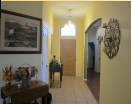
For Sale by Owner