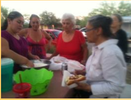
Neighborhood Park Fun