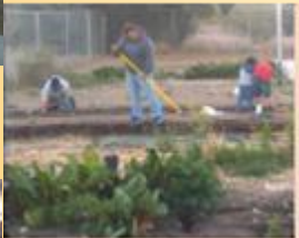
Neighborhood Community Garden