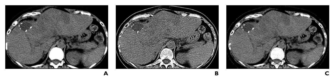
Fig. 2—50-year-old woman with known liver metastasis who has undergone prior open biopsy of liver.

A–C, Axial images of upper abdomen from chest CT obtained in standard (A), lung (B), and hybrid (C) kernel reconstruction algorithms. Standard and hybrid kernels were thought to be equivalent in their ability to display soft-tissue abnormalities.