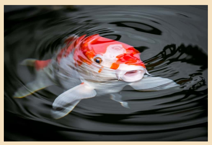
This koi is mature, but hasn't been around for 1,000 years!

Getting a precise age requires examining the fish's ear bone. In practical terms, it's best to stick with a rough estimate. You can obtain an age range by measuring your fish or checking with your supplier. The majority of koi online seem to sell in the one to five-year-old age range.