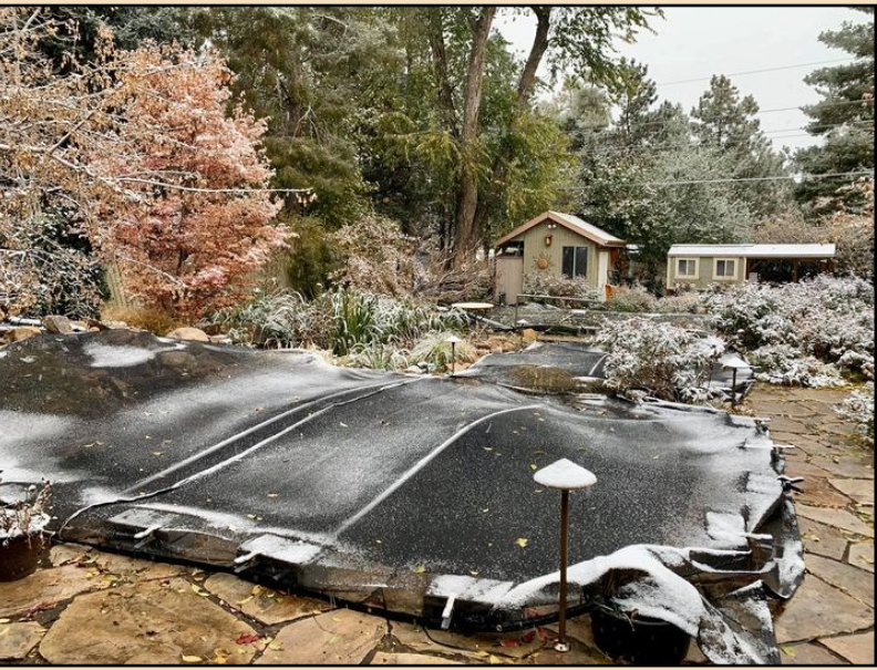
Thanks to Aquascapeinc.com for these pond care tips