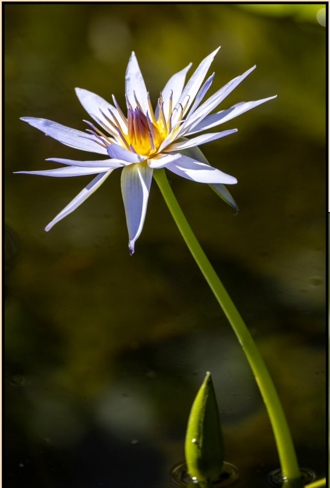
Rhonda Kay in a Utah Pond

Rhonda Kay can get large and should be given at lest a 5-foot grow area to spread out over. You can plant this lily in a typical 1-