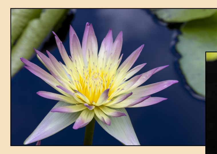
Some of this year's new water lilies. Which is your favorite?