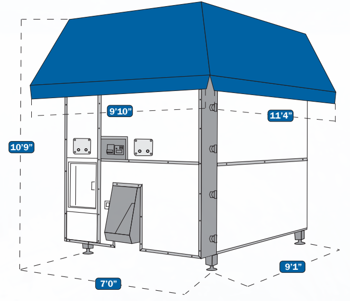
Machine Weight - Approximately 3,550lbs.