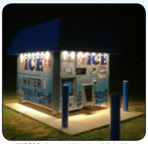
IM2500 shown with optional light kit

The key to the IM2500's exceptional productivity is that Kooler Ice engineers have utilized the full production capabilities of a moderately sized ice maker by substantially increasing the bin size – increasing storage capacity – to create the perfect balance between bin size and ice maker size. This change reduces both purchase and operating costs - while significantly increasing machine production. This design provides owners with a large inventory of ice on the weekends, when sales are highest, to meet demand.