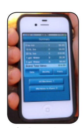
Our Remote Access Monitoring System as seen on an iPhone.

This system allows owners to transform operation and sales data into valuable business knowledge, as well as allows machine functions and inventory to be managed at all times from your computer, iPad or "smart" phone.