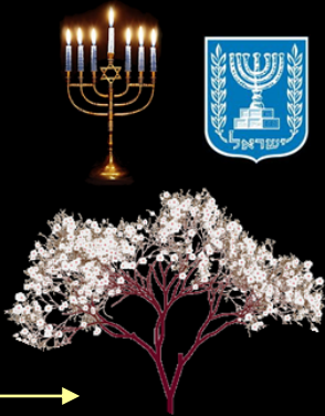
'Menorah Almond Tree'

Jun 8, 2014 = Pentecost (-50 days) = April 20, 2014 4-20