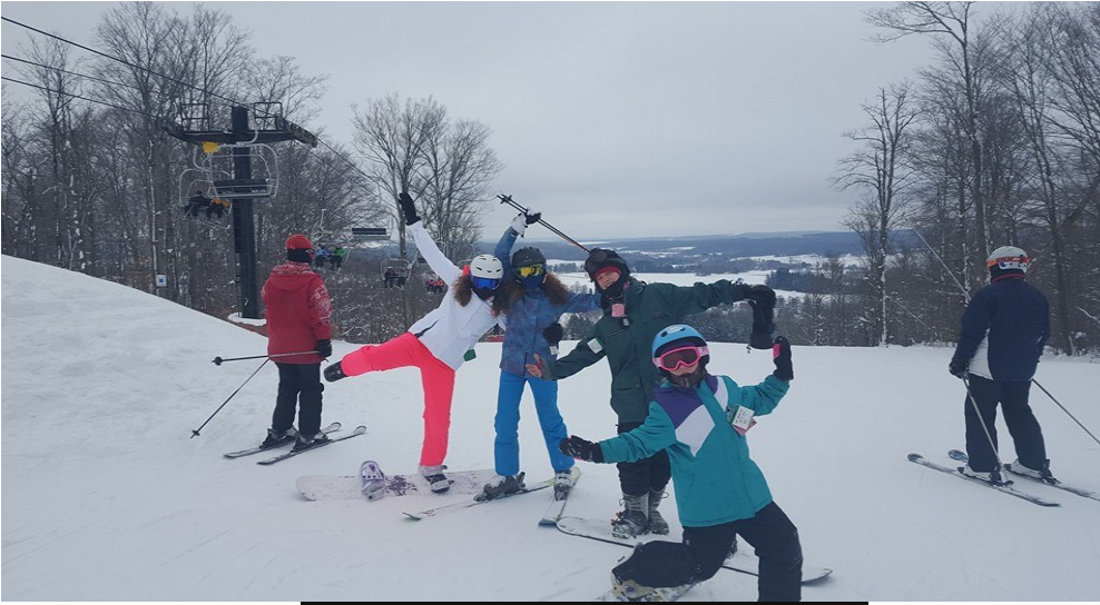
Mars UP Youth at Peek N Peak

Mars UP Church 232 Crowe Ave PO Box 805 Mars, PA 16046