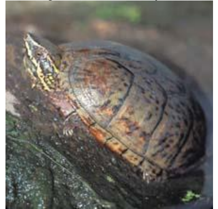
Eastern Musk Turtle