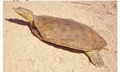
Spiny Softshell Turtle