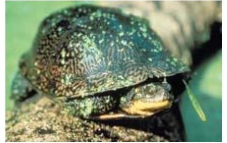
Blandings Turtle...note the yellow chin