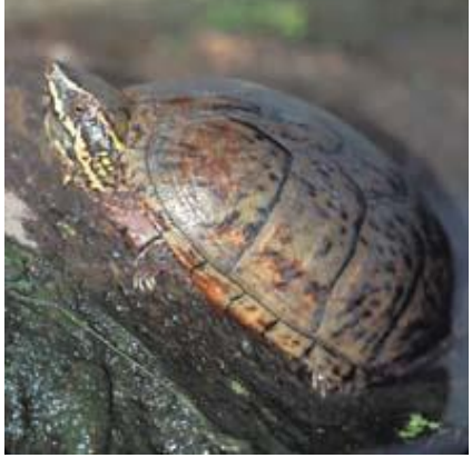
Eastern Musk Turtle