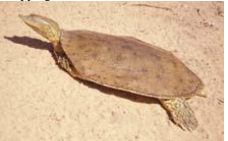
Spiny Softshell Turtle