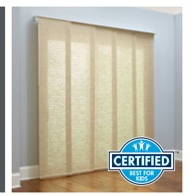
Sliding panels are ideal for large windows and sliding glass doors.