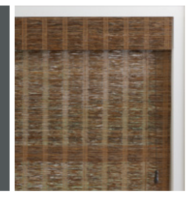
Shade is positioned behind the headrail; valance conceals the hardware.