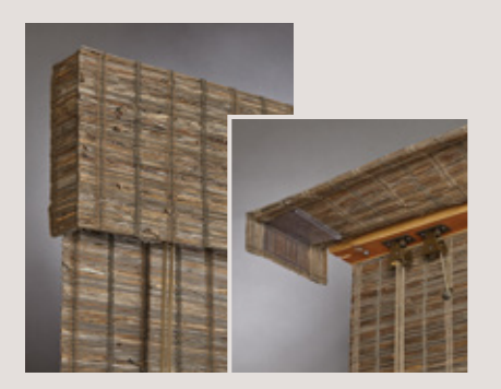
Keeps outside mount valances stable and beautifully aligned. Woven Woods only.