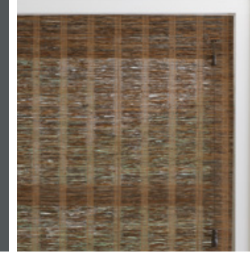
Shade is positioned in front of the headrail. Rear valance hides the hardware from the outside.