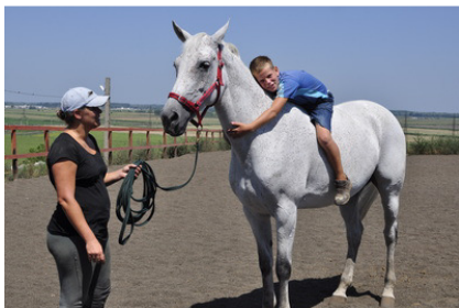
NOROC kids with the Horses