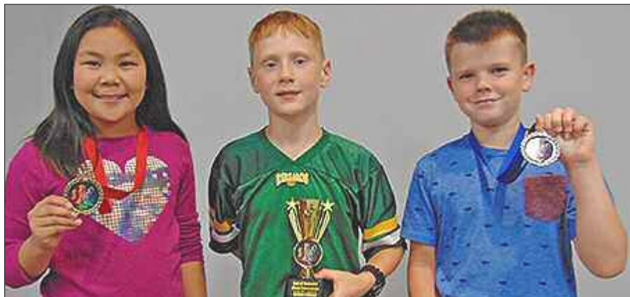
Section C players at the End of Summer Tournament show off their awards.