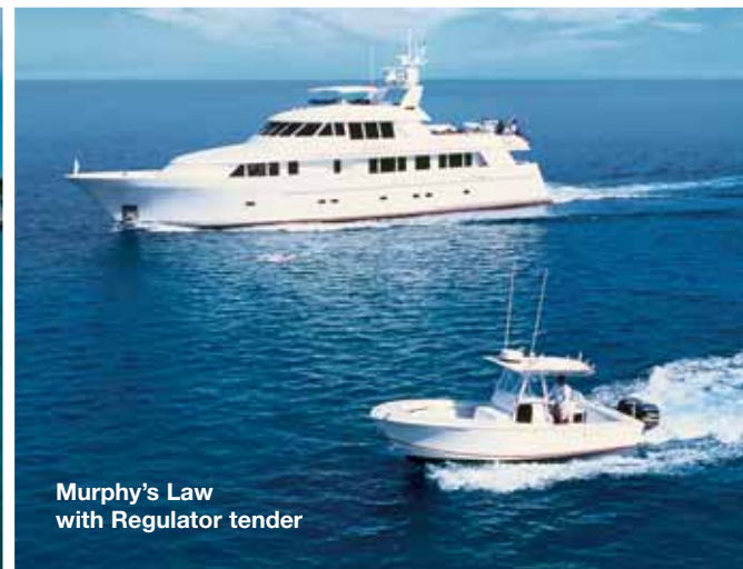
Murphy's Law with Regulator tender