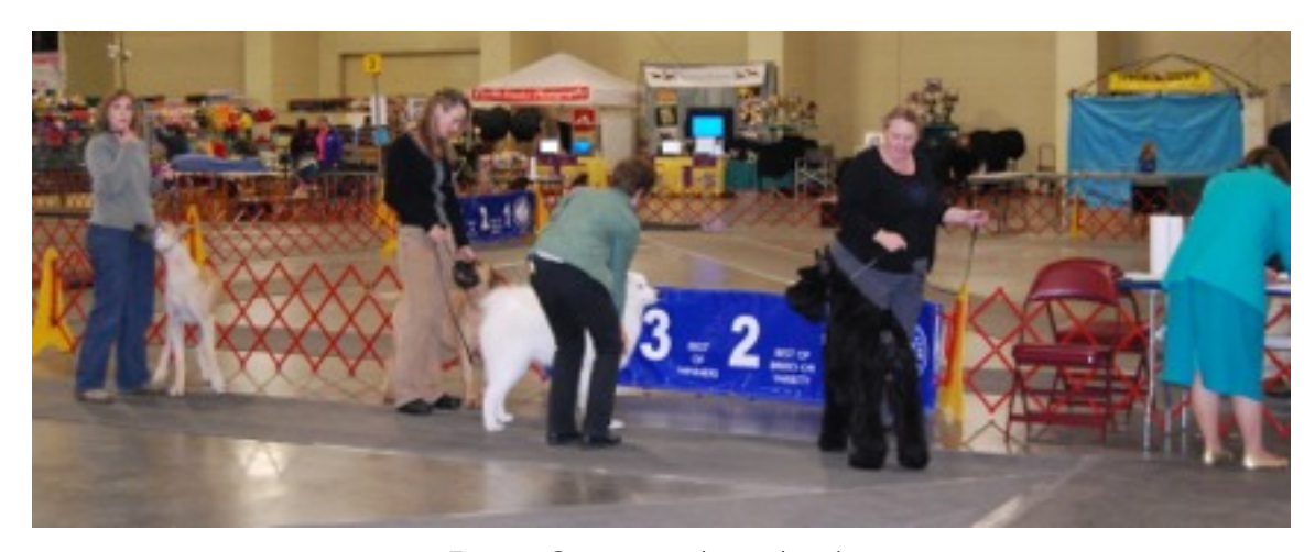
Puppy Group 1st through 4th