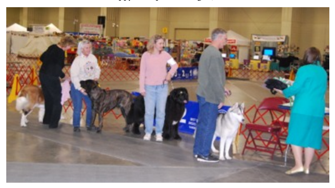
Adult Group 1st through 4th