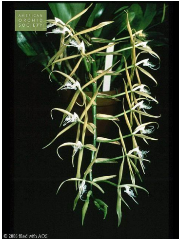
Coilostylis ciliaris