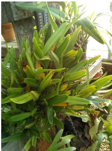
Coilostylis ciliaris actual plant