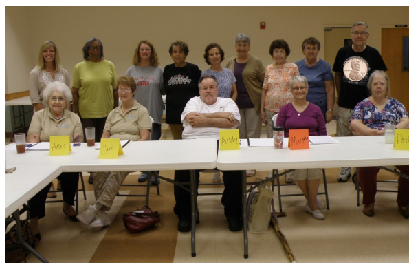
Right: The Matter of Balance class wrapped up it's 8th and final class on August 10th. Thank you to Central Ohio Area Agency on Aging for facilitating this great class.