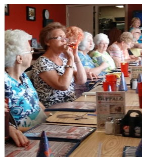
Thanks everyone, you made my birthday great!