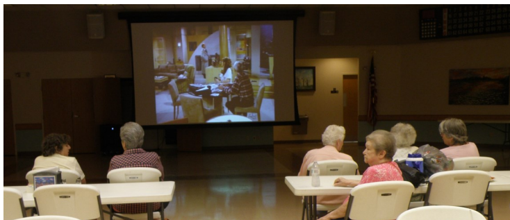
Right: Some of the Friday movie crowd waiting to watch The Shack. We had 28 for the movie that day!