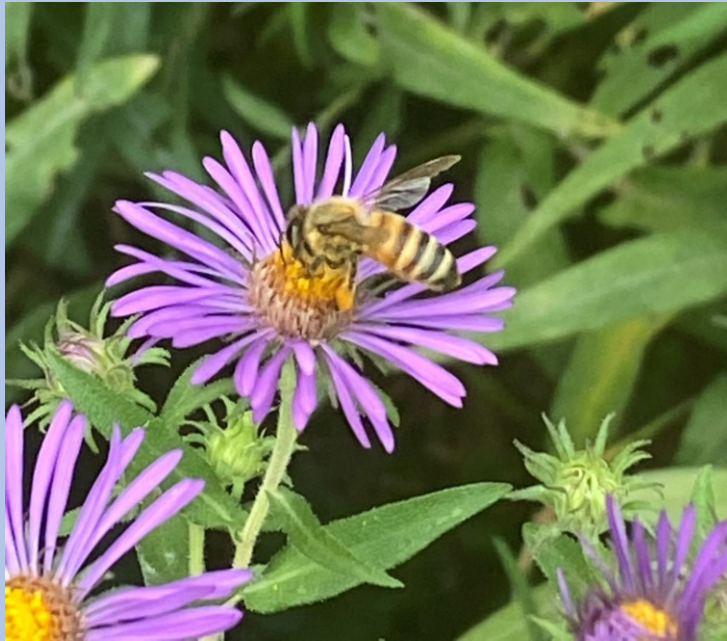
Sept. 3, KC, MO-R. Burns