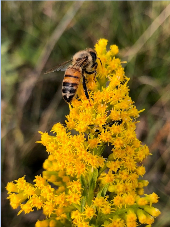
Canada Goldenrod, Sept 18, Berryton, KS