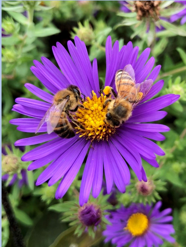
Aster, Sept. 23, Berryton, KS