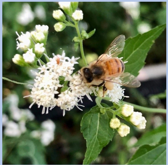
White Snake Root – Sept. 12, Berryton, KS-T. Urich