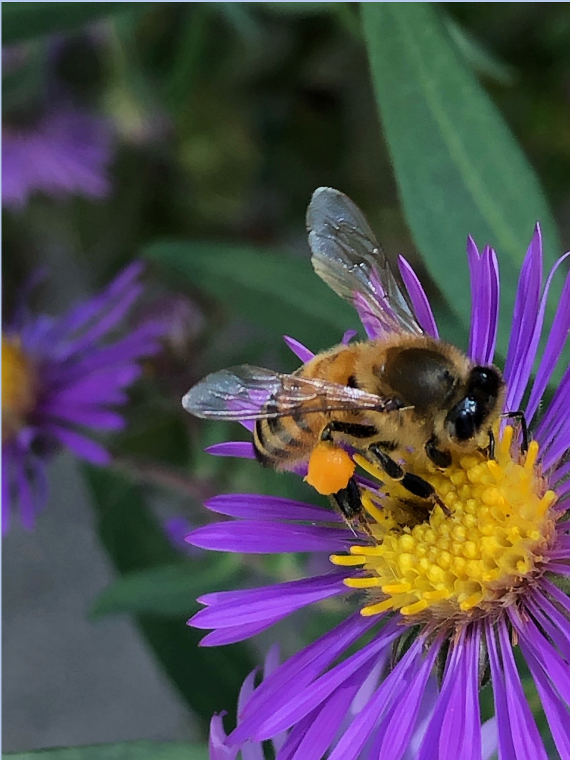
Aster, Oct. 2, Auburn, KS-S. Lane