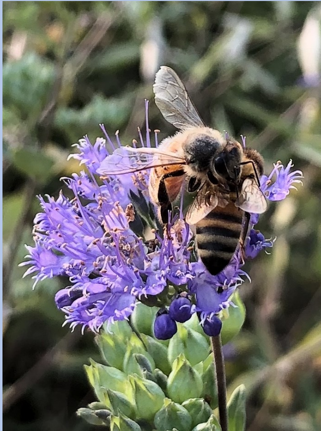
Caryopteris, Sept. 18, Berryton, KS