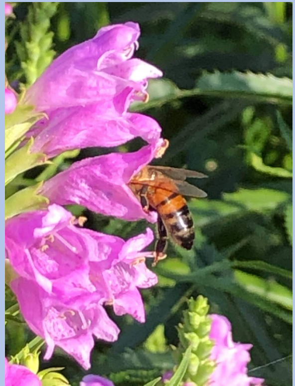
Lupine, Sept. 15, Auburn, KS-S. Lane