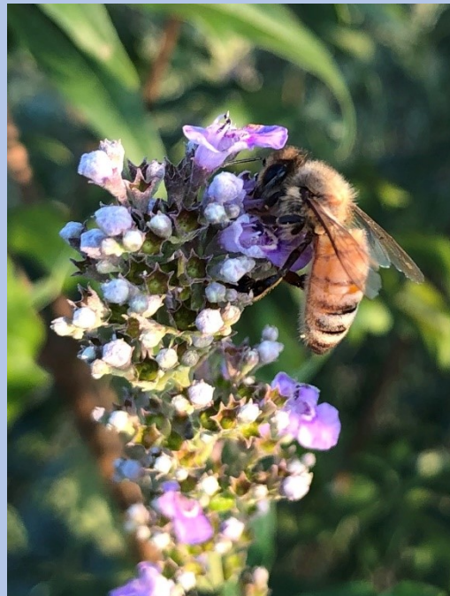
Vitex, Sept. 24, Berryton, KS