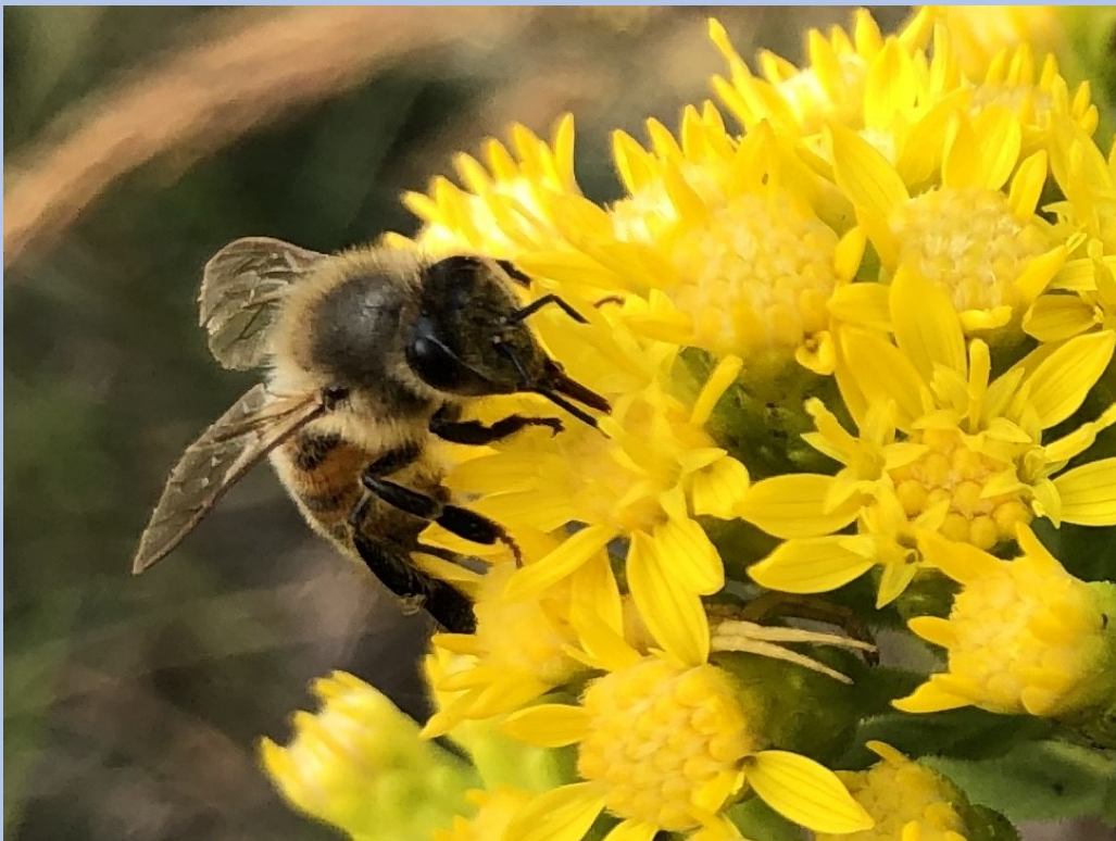
Rigid Goldenrod, Sept. 18, Berryton, KS