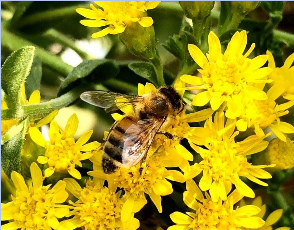
Rigid Goldenrod, Sept. 18, Berryton, KS-T. Urich