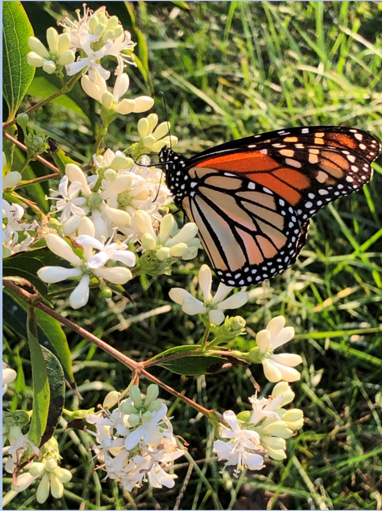
Seven Sons Tree, Sept. 24, Berryton, KS