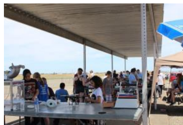
A hit was the Snow Cone Machine