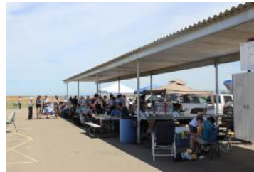
The crowd enjoying some fellowship