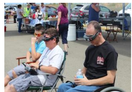
some students enjoying the FPV gear