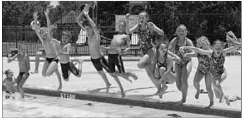
Home of the Lakewood Lightning Swim Team!

New members receive a 25% discount on your first year membership dues!