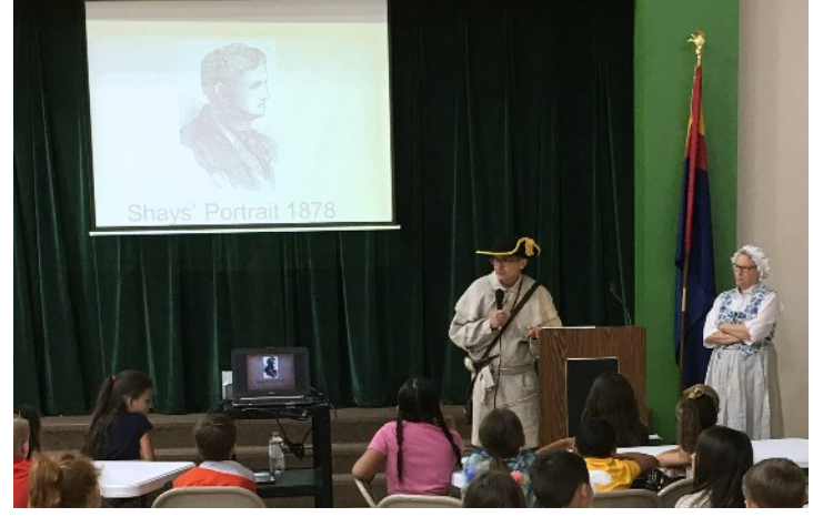
Over 500 students attended. We shared articles of confederation and issues resulting in the constitution