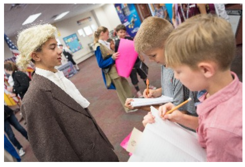
Younger students taking notes