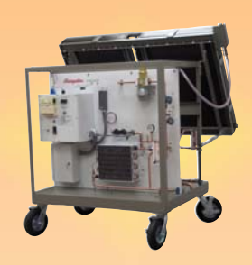
Hampden Model H-SST-1A (Shown with FP Option and CDL Option)

The Hampden Model H-SST-1A Solar System Trainer is an actual solar hot water heating system. System components include a solar collector, circulation pumps, storage tank, heat exchanger, air separator, air handler, solar heating coil, automatic air vents, thermostat, and a control panel with sensors. Gauges, thermometers, and flowmeters permit students to observe pressures, temperatures, and flow rate while the system is in operation. The trainer is mounted on a mobile frame and the collector panel is adjustable for easy positioning in direct sunlight. An electrical fault package option can be added, specify H-SST-1A-FP. A Computer Data Logging Package can be added, specify H-SST-1A-CDL.