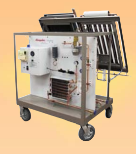
Hampden Model H-SST-4 (Shown with FP Option and CDL Option)

The Hampden Model H-SST-3 Solar Tube Heat System Trainer is an actual solar hot water heating system. System components include 2 vacuum tube solar collector sections, circulation pumps, storage tank, heat exchanger, air separator, air handler, solar heating coil, automatic air vents, thermostat, and a control panel with sensors. Gauges, thermometers, and flowmeters permit students to observe pressures, temperatures, and flow rate while the system is in operation. The trainer is mounted on a mobile frame and the collector panel is adjustable for easy positioning in direct sunlight. An electrical fault package option can be added, specify H-SST-3-FP. A Computer Data Logging Option can be added, specify H-SST-3-CDL.