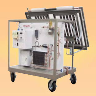
Hampden Model H-SST-3 (Shown with FP Option and CDL Option)

The Hampden Model H-SST-1A Solar System Trainer is an actual solar hot water heating system. System components include a solar collector, circulation pumps, storage tank, heat exchanger, air separator, air handler, solar heating coil, automatic air vents, thermostat, and a control panel with sensors. Gauges, thermometers, and flowmeters permit students to observe pressures, temperatures, and flow rate while the system is in operation. The trainer is mounted on a mobile frame and the collector panel is adjustable for easy positioning in direct sunlight. An electrical fault package option can be added, specify H-SST-1A-FP. A Computer Data Logging Package can be added, specify H-SST-1A-CDL.