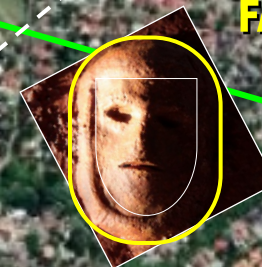
Loftus Versfeld FACE OF ALA-LU