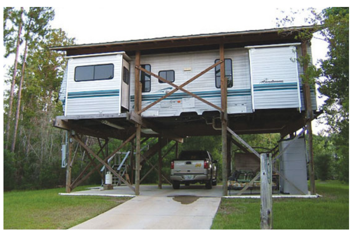
As seen on AppraisalPress.com's funny photos and captions page.

"The appraiser told me if I took the wheels and axles off, it would be considered real property/real estate...It'll be bricked up by next summer...I still use the tail lights for those romantic evenings grilling out with my honey."